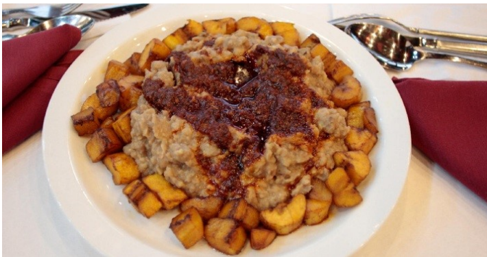
4. Beans and Fried Plantain