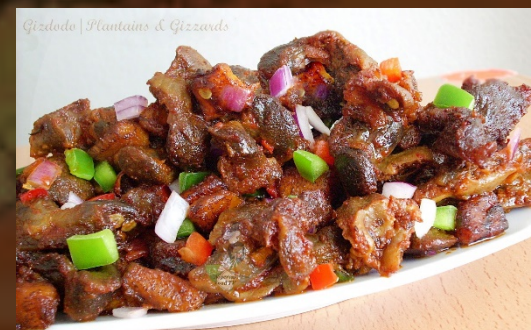
Gizz-dodo: Gizzard & Plantain