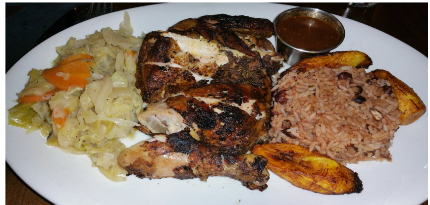
1. Jerk Chicken Rice & Beans w/ Cabbage