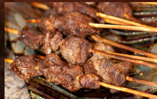
Chicken Gizzard on Stick

Tapioca cooked in coconut milk flakes sweetened w/ Vanilla milk- $2.99