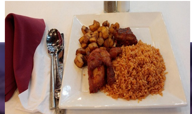
Jollof Rice w/ Plantain & Chicken

Yam Porridge: (Asaro): w/ fried stew or spinach yam cooked in bell pepper & tomato sauce w/ spice and dry shrimp. - $12.99