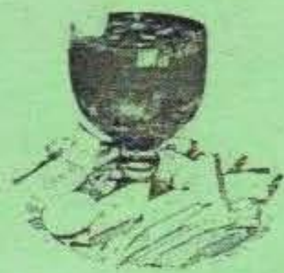
COPTEL DE CAMARON